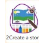
2Create a story